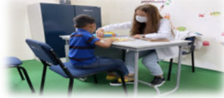
Audiologist & Speech Language Pathologist in session