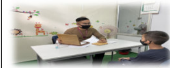
Clinical Psychologist conducting I.O. Assessment