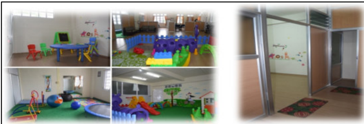
Play area & Therapy room